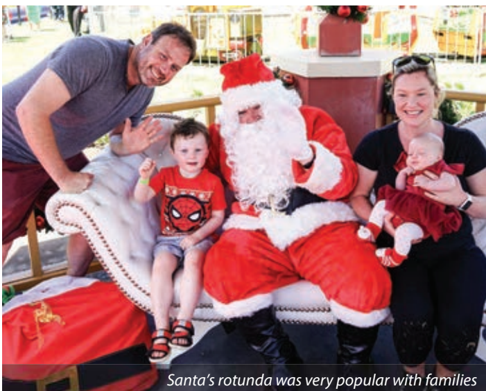
Santa's rotunda was very popular with families

And it wouldn't be Christmas without Christmas gift wrapping. Volunteer gift wrappers did their Santa's helper best at Adelaide Arcade, Harbour Town, Marion Cultural Centre, Cove Civic Centre, and Cheap at Chips Glenelg, Port Adelaide and Colonnades. This year the program raised $12,800.