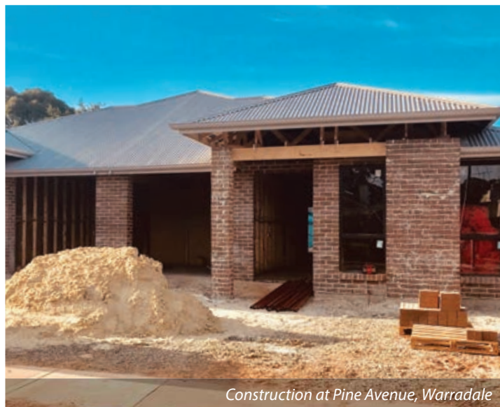
Construction at Pine Avenue, Warradale

The type of accommodation available through Minda Housing includes independent living, one and two bedroom apartments, community homes with two to four bedrooms, and housing for people with exceptional needs.