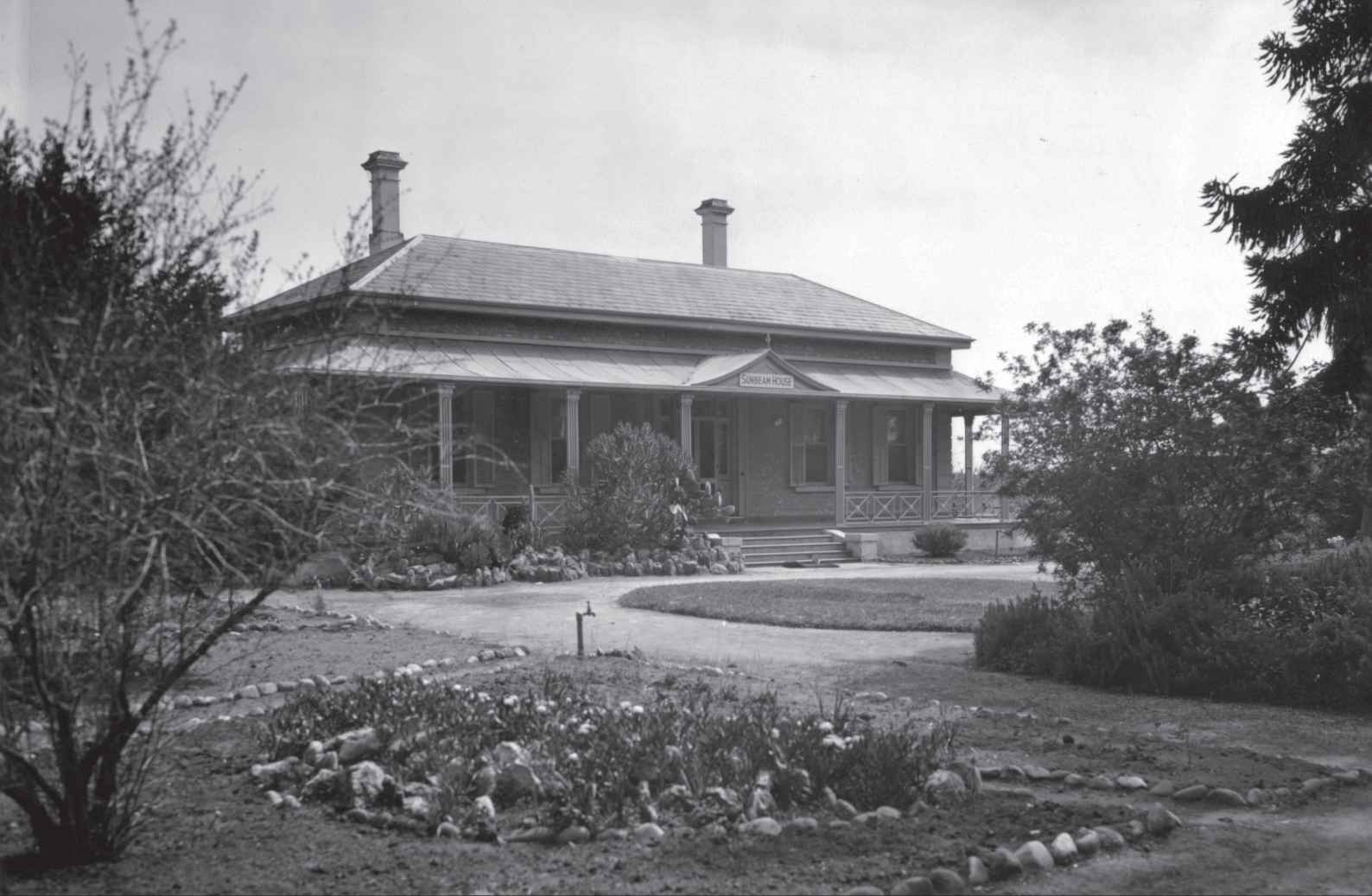
Brighton House, formerly Sunbeam House in 1940