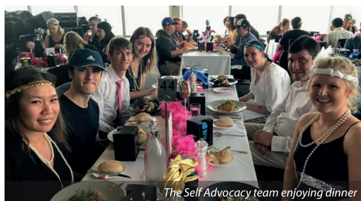
The Self Advocacy team enjoying dinner

F ive self-advocates from Minda attended the 20th annual Having a Say Conference held in Geelong in February.