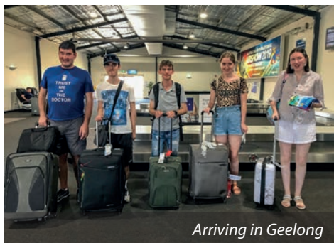
Arriving in Geelong