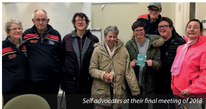
Self advocates at their final meeting of 2018