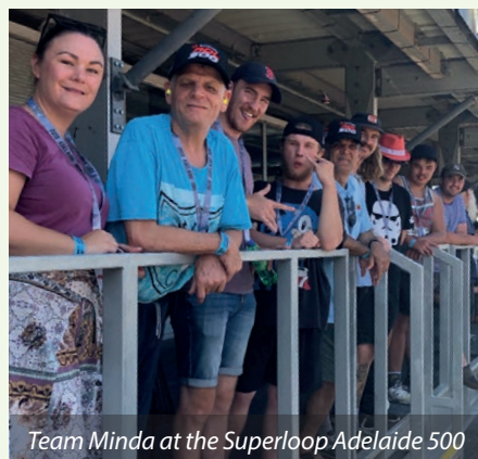
Team Minda at the Superloop Adelaide 500