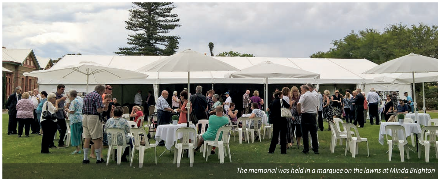
The memorial was held in a marquee on the lawns at Minda Brighton