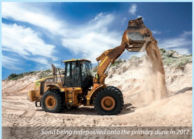
Sand being redeposited onto the primary dune in 2017

More than 80% of the Brighton site will be retained as open space, and as part of Minda’s commitment to preserving and maintaining the natural heritage value there is a well-established program in place to monitor and maintain significant and regulated trees and other plantings.