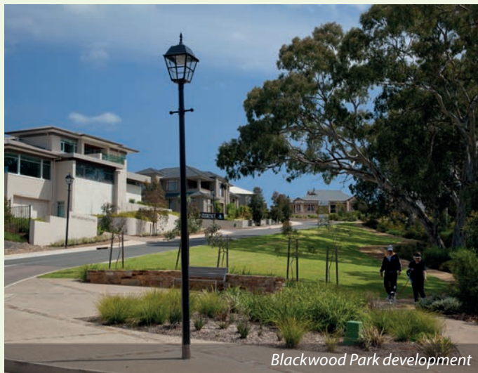
Blackwood Park development

To learn more about ADC and its projects, call (08) 8223 1488 or visit www.adelaidedevelopment.com.au