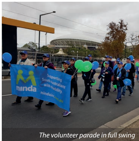
The volunteer parade in full swing