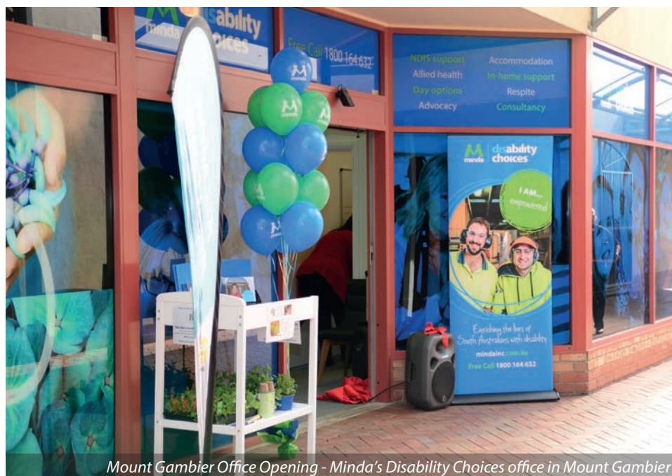
Mount Gambier Office Opening - Minda's Disability Choices office in Mount Gambier