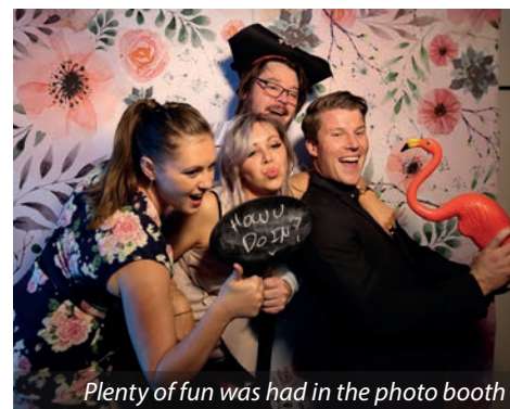
Plenty of fun was had in the photo booth