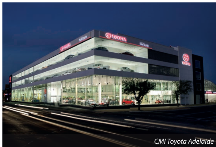
CMI Toyota Adelaide