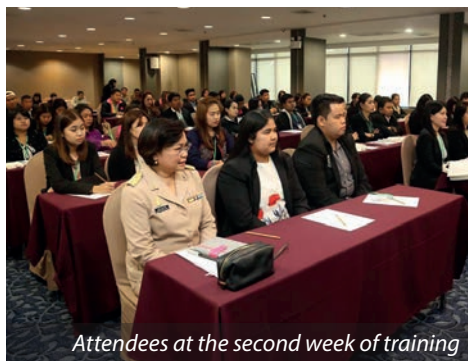
Attendees at the second week of training