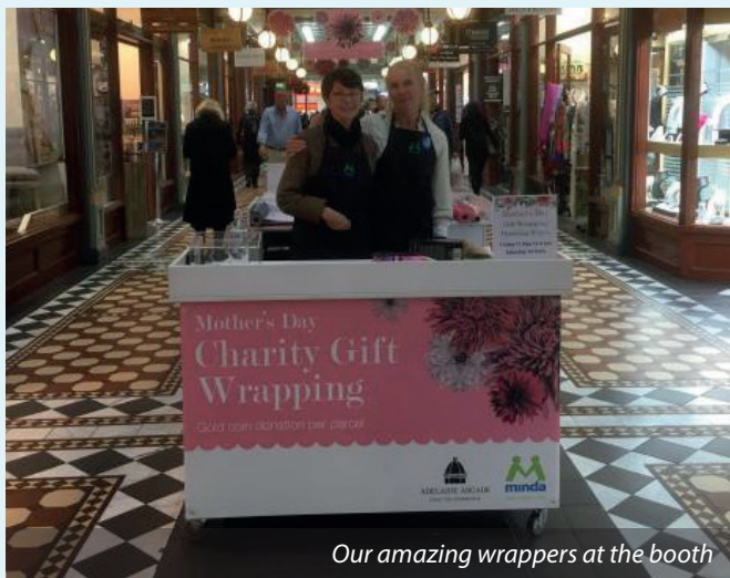
Our amazing wrappers at the booth