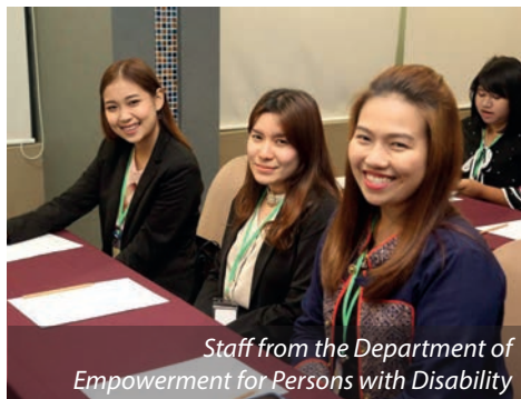
Staff from the Department of Empowerment for Persons with Disability