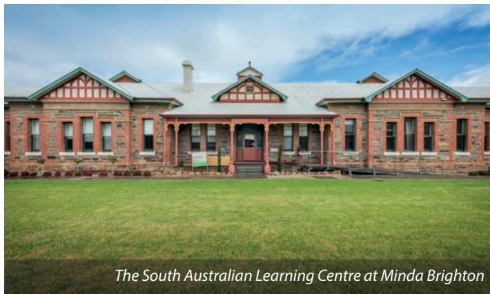
The South Australian Learning Centre at Minda Brighton